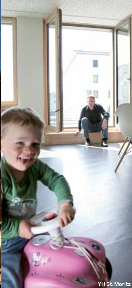
YH St. Moritz