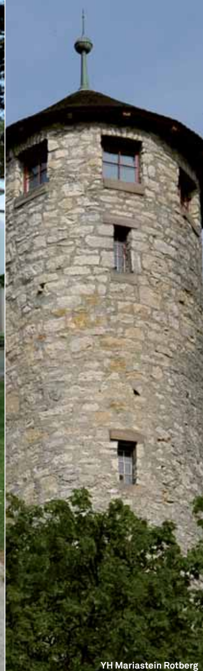
YH Mariastein Rotberg