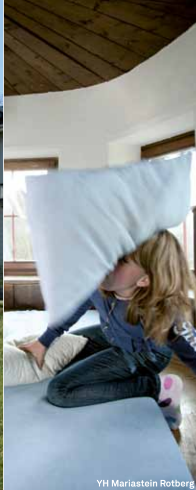
YH Mariastein Rotberg